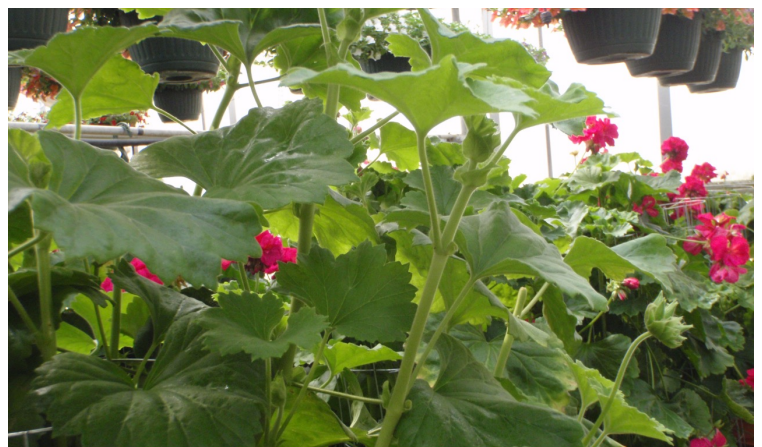
Figure 4. High phosphorus availability promotes internode elongation and can disrupt compact growth in floriculture crops.