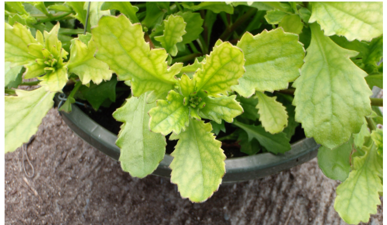
Figure 3. Excessive phosphorus applications can inhibit the uptake of iron in phosphorus-sensitive Australian natives such as scaevola.