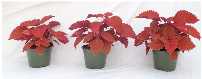
Figure 5. Moderating the phosphorus fertilization rate can be used to manage plant growth (left to right: 2.5, 5, and 10 ppm P).

Understanding how much elemental phosphorus your fertilizer delivers is essential for managing early growth and internode length in floriculture crops. While high-P fertilizers may be appropriate for rooting cuttings or correcting deficiencies, routine use during vegetative production can lead to excessive elongation and unnecessary nutrient loading. By calculating ppm P at your target N rate, you can better align fertility with crop needs—supporting compact, marketable growth without overapplying a nutrient that's easy to overdo.