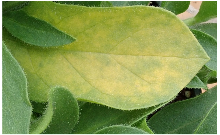
Figure 2. Olive-green spotting on leaves can appear under warm conditions as another sign of low phosphorus.

In many floriculture crops, phosphorus availability influences shoot elongation, particularly during the early vegetative phase. High P concentration, when paired with high nitrogen (N) specifically ammoniacal-N, can promote rapid cell expansion and increased internode length. This is often observed in crops like petunia, calibrachoa, and geranium, where limiting internode stretch is an important factor when developing a high-quality plant. While P is essential for root initiation and cell metabolism, excessive availability can shift