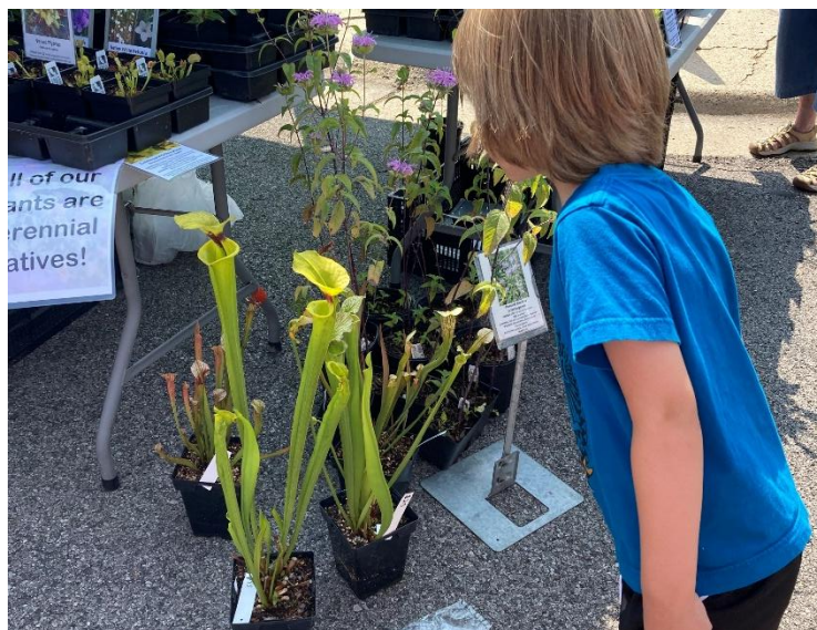
Figure 4. People with children are interested in plants that attract different types of wildlife.