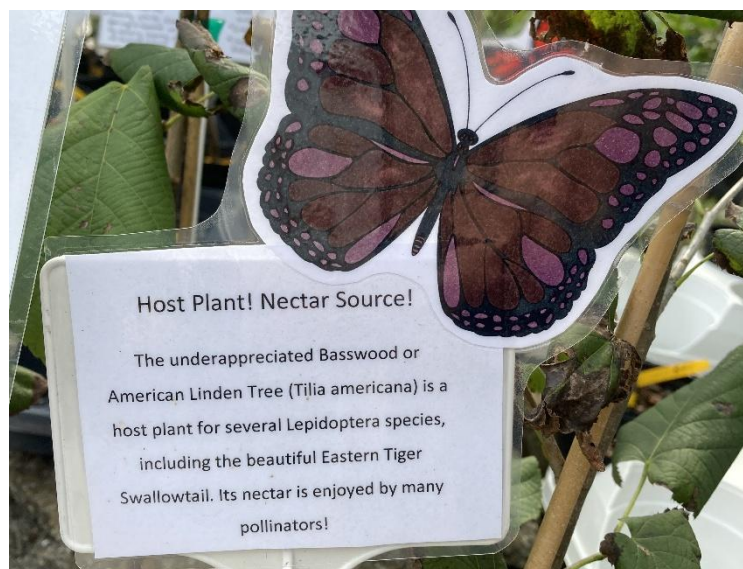
Figure 3. Point-of-sale sign at a retail garden center in Knoxville, TN.