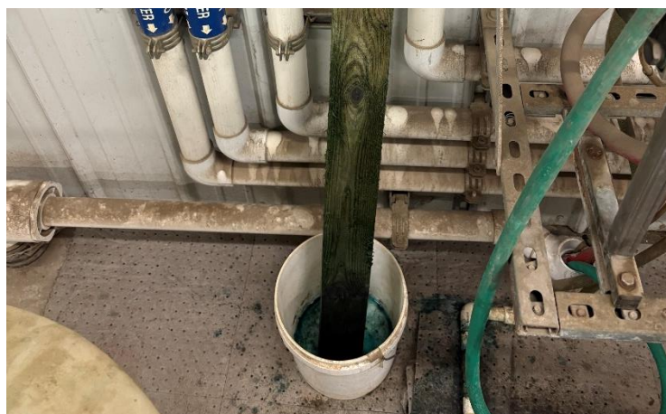
Figure 2. This is the “mixing stick” used to blend fertilizer stock solutions. Seemingly innocuous enough, it turned out to be the cause of the injector malfunction.

The injector itself seemed ok, but after looking at different parts, the grower found a piece of wood that was blocking sufficient uptake of fertilizer stock solution. Where in the world did this piece of wood come from? Although it seems unlikely to find wood in an injector, the grower realized the “mixing stick” they use when mixing stock solutions (Figs. 2 and 3). Once the wood was removed, the EC of the fertilizer solution was spot-on, and with the Boston ferns started receiving the correct amount of feed, the grower had time to look for a new stick (Fig. 4)!