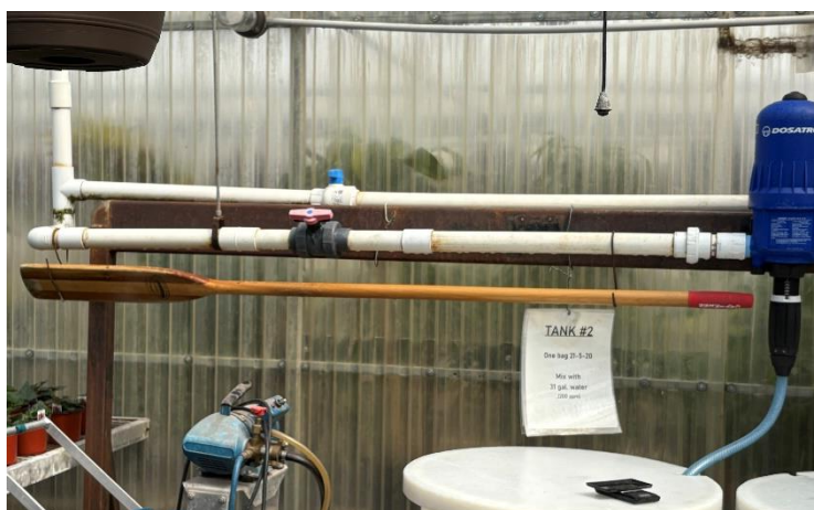
Figure 4. Here is a different grower with a very similar set up. While the injector is different, it has the same two-stock tank set-up, along with a mixing stick. Note that this “mixing stick” is showing much less wear and tear, reducing the chances it will inhibit proper functioning of injectors.