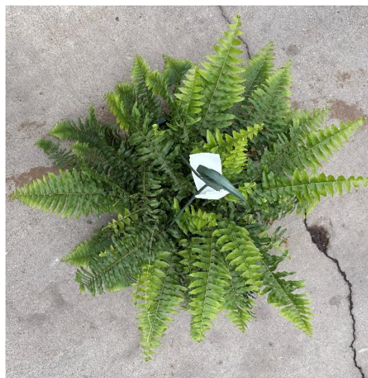
Figure 1. This Boston fern ( Nephrolepis exaltata ‘Bostoniensis’) appeared chlorotic. After the greenhouse environment and chemical applications were ruled out, mineral nutrition and fertilizer seemed to likely be the root cause of the issue.

This Boston fern crop (Fig. 1; Nephrolepis exaltata ‘Bostoniensis’) wasn’t looking right. In looking at the foliage, the chlorosis clearly indicated something wasn’t right with the crop. In reviewing the environmental data, the air temperatures and light intensities were all within normal ranges and meeting the target setpoints, which ruled out problems with the growing environment. Nothing had been sprayed on the crop, so phytotoxicity from a plant insecticide, fungicide, or plant growth regulator could also be ruled out.